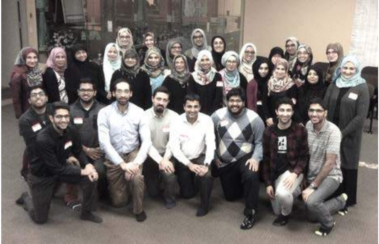
Representation from 3 madaris was present among the 29 participants.